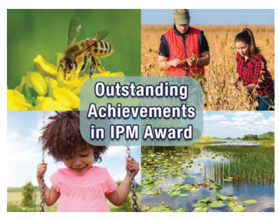
The deadline for nominations is Friday, December 2, 2022.