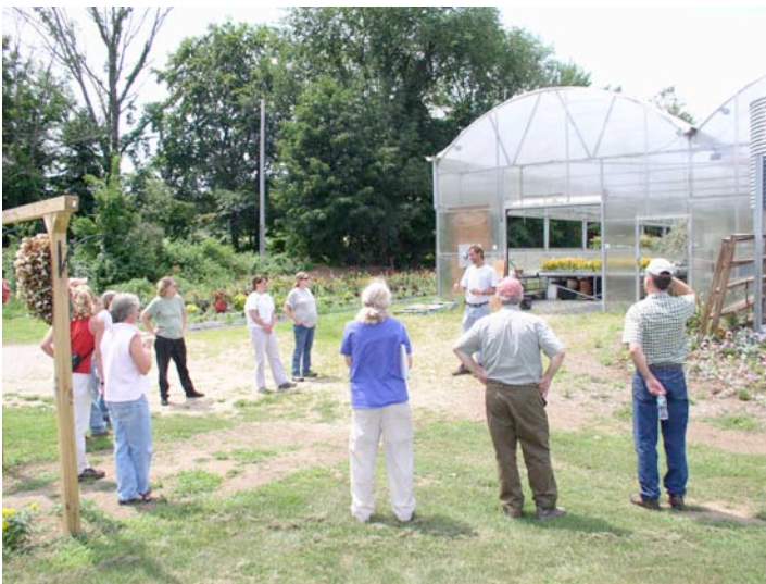
Massachusetts Workshop: Greenhouse at the Kosinski Farm