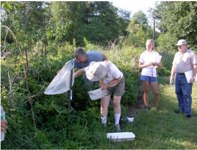
Massachusetts Workshop: The group gets a look at the contents of a pheromone trap.