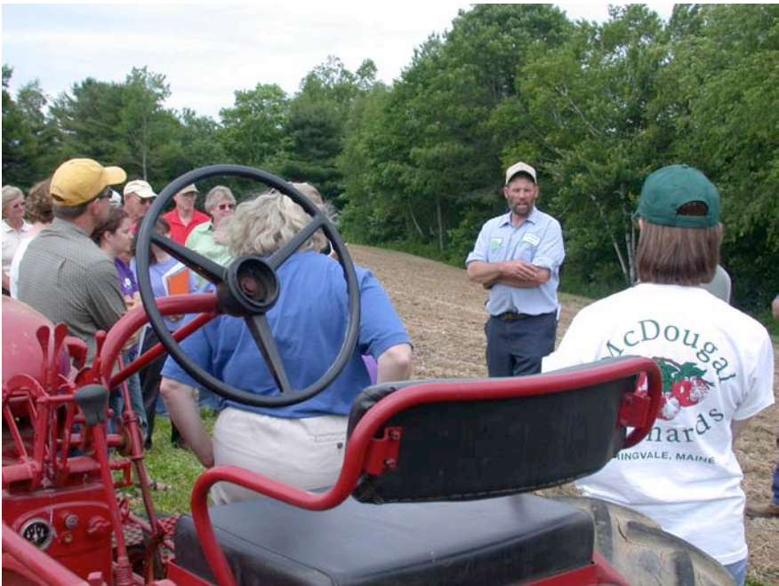
Maine workshop: Nearly 90 people learn about reduced tillage machinery and ways to increase soil tilth.