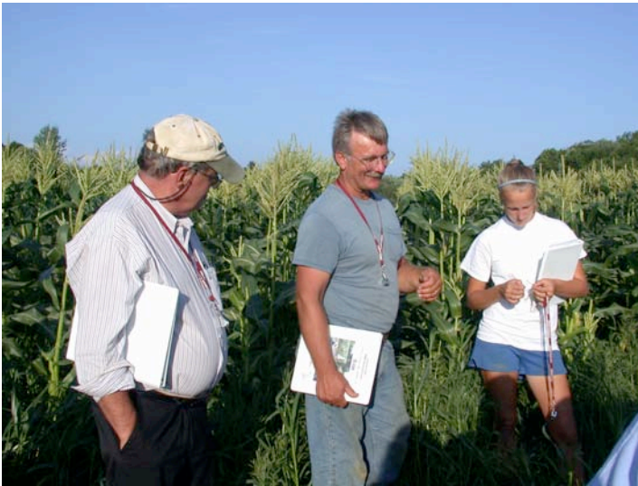
Massachusetts Workshop: Participants learn about scouting sweet corn.