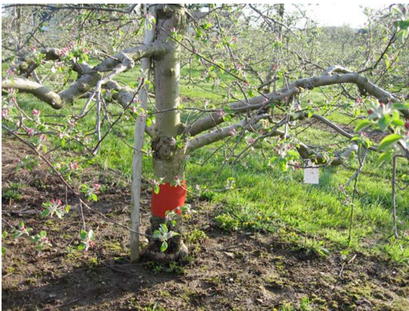
Connecticut workshop: The hanging white sticky trap monitors tarnished plant bug and eastern apple sawfly; the red sticky trap on the trunk monitors apple blotch leafminer.