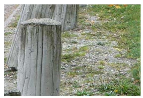
Over time, this gravel in Alki Park in West Seattle has filledin with dirt and weeds because it was too coarse.

In some cases, gravel has been laid in a park in an attempt to reduce the area to be maintained but has unsuccessfully suppressed vegetative growth.9 For example, in Alki Park, a pesticide-free park in Seattle, a gravel area surrounds 2-foot concrete columns that serve as barriers to vehicles. The gravel is coarser than the quarter-inch minus rock that Renfrow (Seattle) recommends. As a result, soil has settled in and weeds have grown. Removing all of the gravel would be a challenge, and the finished product would need to be level with the surrounding turf. As Phil explains, instead of removing the gravel, a layer of quarterinch minus rock could be laid to smother the weeds over winter. In the spring, a 1-2-inch layer of quarter-inch minus rock could be laid and compressed to form a new hardscape. Another option would be to seed grass into the original loose gravel to gradually blend the area visually into the surrounding turf.9