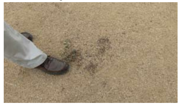
With his shoe, Phil Rossi points to a weed emerging from this fairly weed-resistant and fine decomposed granite softscape of the Band Concourse in San Francisco's Golden Gate Park. (above)

To create a unique or perhaps more natural appearance, compressed, crushed rock is sometimes used instead of concrete or asphalt under fences and as a pathway material, although the crushed rock can create a hazard when used with string trimmers.6 Often referred to as "softscapes," the rock particles, such as decomposed granite (DG), are laid and then compressed, using a vibrating machine or roller to form a firm surface that is weedresistant. Weed pressure does increase over time.1