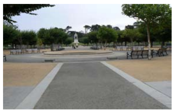
Decomposed granite softscape adds contrast and sophistication to the Band Concourse in San Francisco's Golden Gate Park.

Phil Renfrow, Senior Gardener, Seattle Parks and Recreation, suggests using "quarter-inch minus"-sized gravel instead. It is cheap, durable once compacted, and the ideal coarseness. Weeds can grow in finer gravel, and dirt fills in the spaces between the coarser gravel particles. The use of "quarter-inch minus" gravel is also compliant with the Americans with Disabilities Act (ADA), allowing people in wheelchairs to pass over without difficulty.