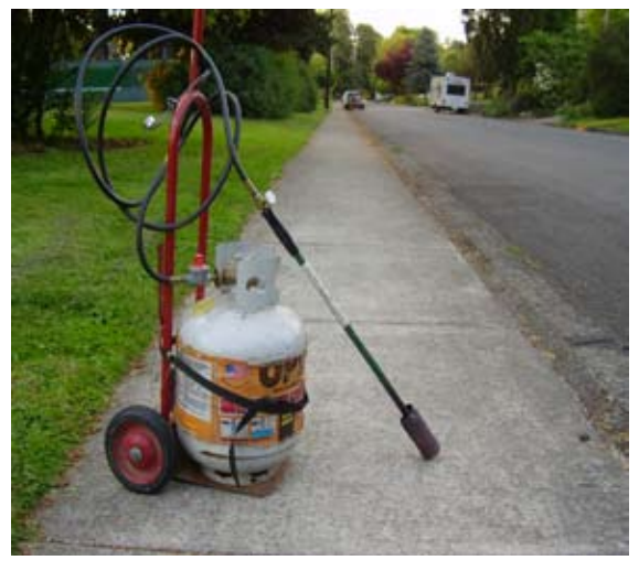
Propane-powered flame weeder attached to a dolly-mounted

According to Fiorello, 10-pound, backpack-mounted tank devices are more efficient than the dolly-mounted alternatives, but most users prefer to haul a dolly-mounted tank around because they are concerned about wearing explosive material on their backs.8 The most appropriate type of flamer for hardscapes and fence lines is the kind that has a narrow nozzle and shoots a flame from the end, such as the Red Dragon.8,11,12 Although the single-headed version is depicted, Nicholson recommends the more powerful and efficient double-headed version for use in parks.<sup>12</sup>