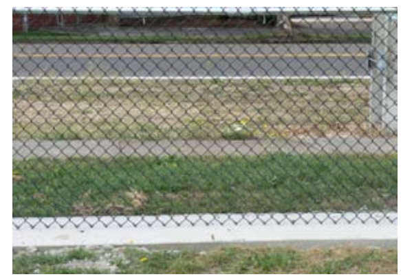
concrete mow strip under a fence along sports field in Ida Patterson Park in

newly constructed Ida Patterson Park in Eugene three-fold, but the savings on weed control will surpass this extra initial cost.