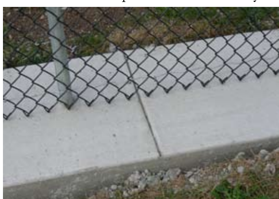
Concrete mow strip is segmented into blocks, with expansion joints.

Installation of mow strips under or around fixtures, such as fences, garbage cans, and benches, minimizes the need for weed control and can reduce herbicide use. Mow strips reduce the surface area that supports weed growth and also provide mowers needed space to travel close to and around obstacles without bumping into them, thereby decreasing the risk of damage to equipment and structures.1 Bob Fiorello, Gardener with the San Francisco Recreation and Park Department and Pest Control Advisor of the San Francisco Botanical Garden, points out that mow strips also limit the need for line trimmers or small mowers, thereby increasing the feasibility of using larger equipment, which saves departments money. Therefore, mow strips are a good investment, saving money in the long-term by allowing staff to maintain parks more efficiently.<sup>1,2,3</sup>