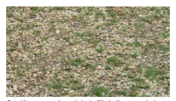
Over time, as growing substrate fills-in the spaces between rock particles, weeds emerge from a coarse decomposed granite softscape in the San Francisco Botanical Garden. (below)

Decomposed granite acts as an attractive and firm path through the San Francisco Botanical Garden. (right)