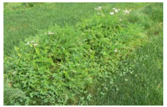
This dense ecolawn mix test plot, planted by Rob Hallett (Eugene), grows faster than the surrounding irrigated turf and out-competes weeds.

and fertilization. "Ecolawn" mixes grow densely and out-compete weeds. They require some time to establish; therefore, "starting with a clean slate is important." Hallett (Eugene) explained that ecolawn mow strips require different management from most turf.<sup>2</sup>