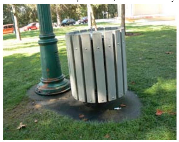
Installing this garbage can and lightpost side-by-side, rather than apart, in Julia Davis Park in Boise meant that only one mow strip was needed.

A newer concept, installing mow strips when a new park is designed or old park is renovated, is an example of wise longterm planning. New ADA requirements are resulting in hardscape replacement in some cities, like San Francisco, where Fiorello is advocating for the addition of mow strips along the replaced paths.8 Although mow strips add to the cost of construction, in the long-term the money saved on weed control will be greater than the initial cost. Clustering fixtures together, in order to minimize the number of mow strips needed, can save money.