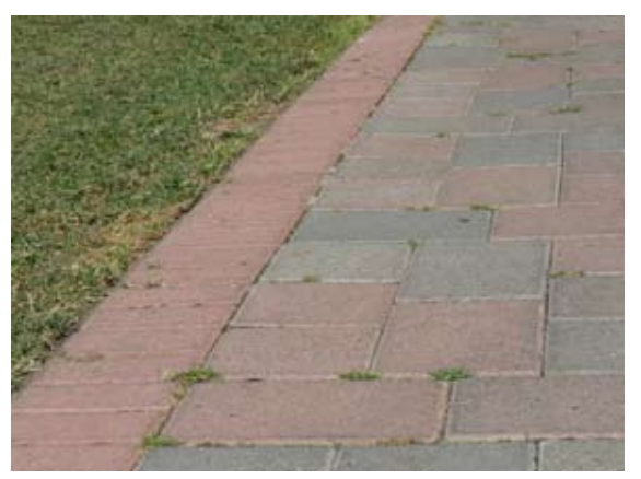
A long brick path in a park in Bend has weeds.

A newer concept, installing mow strips when a new park is designed or old park is renovated, is an example of wise longterm planning. New ADA requirements are resulting in hardscape replacement in some cities, like San Francisco, where Fiorello is advocating for the addition of mow strips along the replaced paths.8 Although mow strips add to the cost of construction, in the long-term the money saved on weed control will be greater than the initial cost. Clustering fixtures together, in order to minimize the number of mow strips needed, can save money.