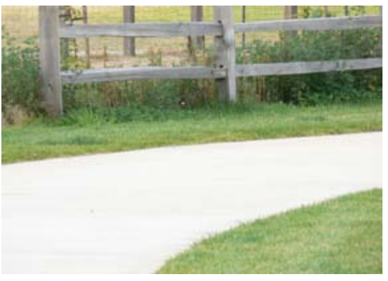
Installed in Candelight Park in Eugene after the initial park design, the wooden fence with no mow strip underneath serves as a weed haven.

Sometimes a fixture, such as a fence, is unnecessary and can be eliminated from a project during the planning phase without reducing aesthetic, safety, or other values. If needed, minimizing the length of the fence and placing it only where needed can help to reduce cost. Whenever a new fence is planned, Belanger (Boise) requests that the bottom rail be at least two to three inches above the ground to allow weed abatement with a line trimmer, or "weedeater."