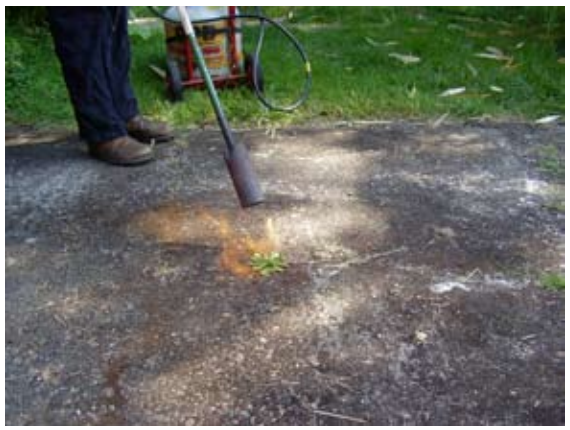
Flame from flameweeder passing over dandelion

Although the propane-powered Red Dragon flame weeder produces a flame, burning the weeds is not actually necessary; rather, blanching with the heat radiating beyond the end of the flame is sufficient to kill weeds and does not produce a burned appearance. "Green flaming" involves a quick pass (a rate of about 1-2 seconds per foot) of the 2000° F heat from the nozzle over the weeds to sear them, Fiorello (San Francisco) says.8 The short exposure to the intense heat is enough for plant cell walls to burst. Treated weeds will wilt and die, a process accelerated by warmer weather.8 Fiorello evaluates green flaming efficacy by the "thumb print" test, in which a treated leaf is pressed firmly to leave a tell-tale print, indicating that cells are disrupted and the treatment will work.<sup>1</sup> Green flaming causes gradual death so that the plant is less likely to signal the roots to re-grow. 1,8,11 "Think of blanched weeds rather than blackened weeds,"Fiorello suggests.1 Green flaming also conserves fuel over weed burning. Even under ideal conditions, repeated treatments are needed to kill the weeds. Over time, flametreated weeds will die because they are not able to photosynthesize when their green tops are knocked back repeatedly. Although some staff and some parks patrons feel that flaming is unsafe, the safety risks can be minimized when done at the proper time - when there are no patrons around and during the wet season