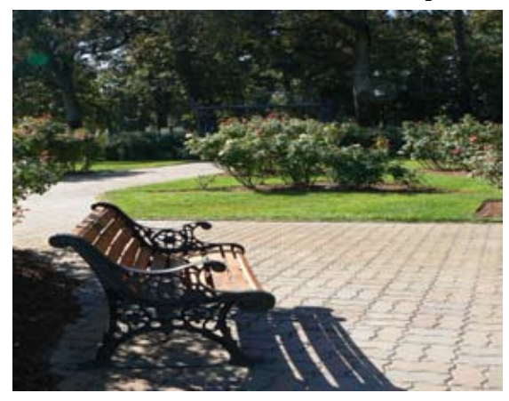
Hardscapes containing many cracks add a more sophisticated look to the the Boise Rose Garden, but its placement poses a challenge to weed control.

appropriate Selecting hardscape materials and putting them in the right places is another way to reduce long-term costs. The more cracks there are in a hardscape, the more opportunities there are for weeds to grow. However, sometimes hardscapes designed with many cracks, such as unmortared brick or stone, have been selected by planners for a more formal appearance, notes Paul Stell, Natural Resource Manager of the Bend Parks and Recreation District.<sup>14</sup> The cost of weed control may be greater for brick or stone paths that are naturally full of cracks than the savings on repair, as compared to more standard path material, like asphalt. Therefore, although these materials may be attractive and permeable, they should be avoided from a weed control standpoint.14