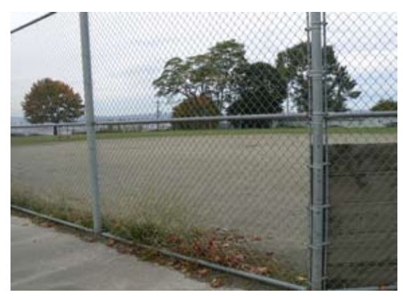
A sports infield behind this fence in the park at Yesler Community Center in Seattle is kept weed-free using a Harley rake tractor attachment.

Seattle uses a tractor attachment, called a Harley rake, to scrape away weeds in dirt paths and to level sports infields. The machine can be set to cut to a certain depth for stripping weeds or grading. A roller at the rear leaves wind-rows of weeds behind for easy pickup and it grades as it goes, a "really elegant design," according to DeCaro (Seattle). The machine needs to be used every year to kill the weeds while they are young but cannot be used in the wet season, as it will not operate in the mud. Early fall is a critical time to use the Harley rake, DeCaro says. A versatile machine, the Harley rake can also be used for cutting sod and tilling. 10