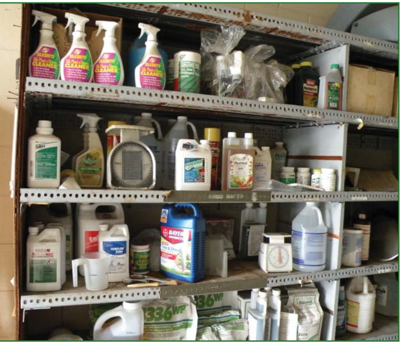
Any pesticides kept on school grounds should be stored in locked areas accessible only to properly trained and licensed professionals.

For over two decades, schools have been using IPM to reduce pesticide use and associated costs. In 1985, the Montgomery County Public Schools in Maryland made 5000 pesticide applications. Just three years later, after transitioning to IPM practices, only 600 pesticide