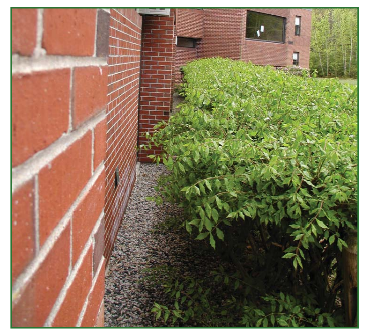
Vegetation is trimmed away from the building to prevent ants and other pests from travelling onto the structure. A concrete or stone mulch strip placed along the perimeter excludes ground vegetation that can conceal pests and pest activity.

According to the 2006 report, Greening America's School: Costs and Benefits (Kats), green-building practices yield savings of around $70 per square foot in energy costs, greater staff productivity, and improved student and staff attendance. Incorporating IPM into green schools is a natural fit contributing to lower costs and higher productivity.