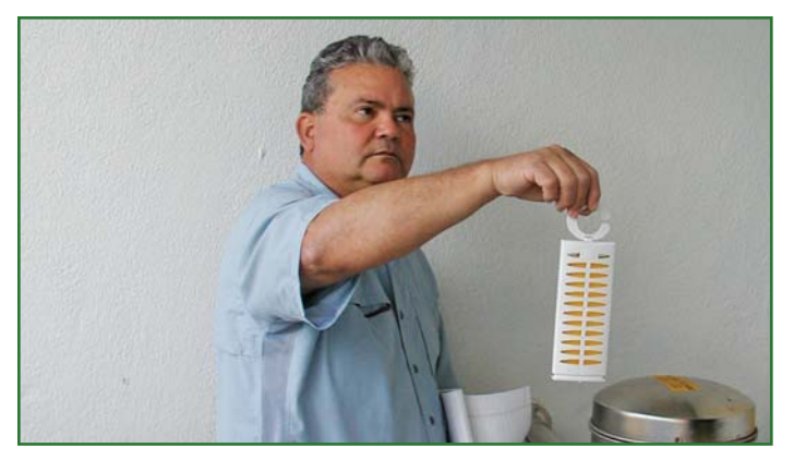
Ineffective pest control can lead to staff resorting to over-the-counter pesticides to try to resolve persistent problems. In this case, staff frustrated with flies in a loading dock area have hung a pesticide strip (dichlorvos). Cleaning the organic matter out of loading dock drains, and keeping them clean, eliminated the breeding site and the flies.

When needed, pesticide products can be selected that minimize risks to students and staff (Green and Gouge 2008). Many states have laws requiring parental notification prior to pesticide applications, as well as posting pesticide application warnings at applications sites (Owens 2010).